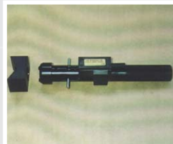
LKA Impact Tester