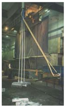
Pick up Grab