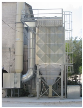
Dust Fume Filter from Galvanizing Furnace