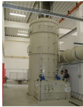
Scrubber for Pre-Treatment Fumes