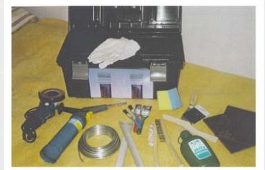
Galva Guard Kit. Zink touch up solder