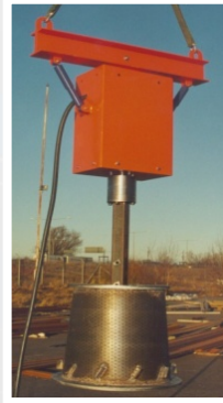
Electric Driven Centrifuge. (Can be automated)